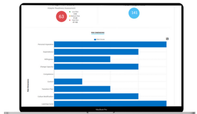
The higher the risk level from this tool the greater the likelihood of significant resistance to a change project. The tool is most effective when people have enough information about the change to respond knowledgeably to the questions